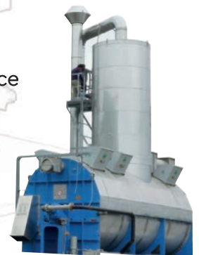
VetterTec tube bundle dryer with bag filter in ATEX/NFPA design